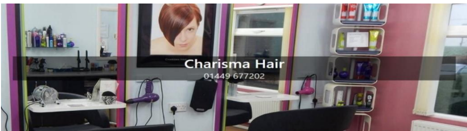
Charisma Hair 01449 677202