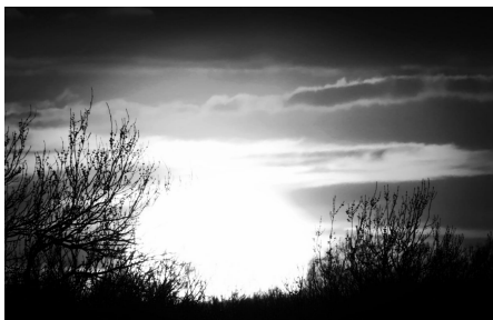
Sunset over Great Finborough