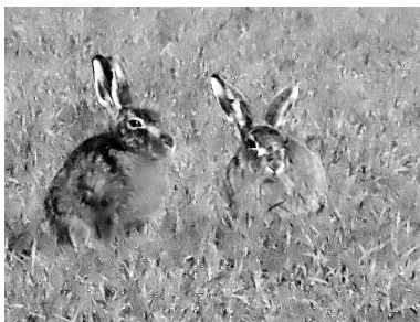
Hares in Field

We live in such a beautiful part of the world. I thought it might be nice to include a monthly photo which shows off the landscape or wildlife which we see in the village and surrounding areas. I've added a couple below as examples, can you do better? If so please submit a black & white photo to me before the publishing deadline for a chance to be included. Please include your name and a brief description. Please note, the editor's decision is final.