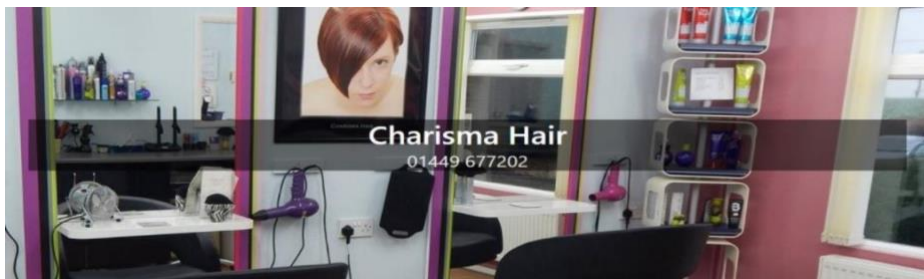
Charisma Hair 01449 677202

86a Forest Road, Onehouse charismahair.co.uk / 01449 677202