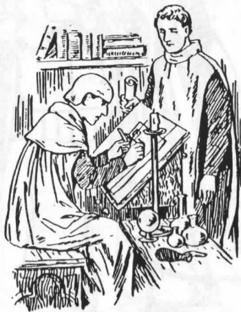
5 SCRIBE AND CLERK.